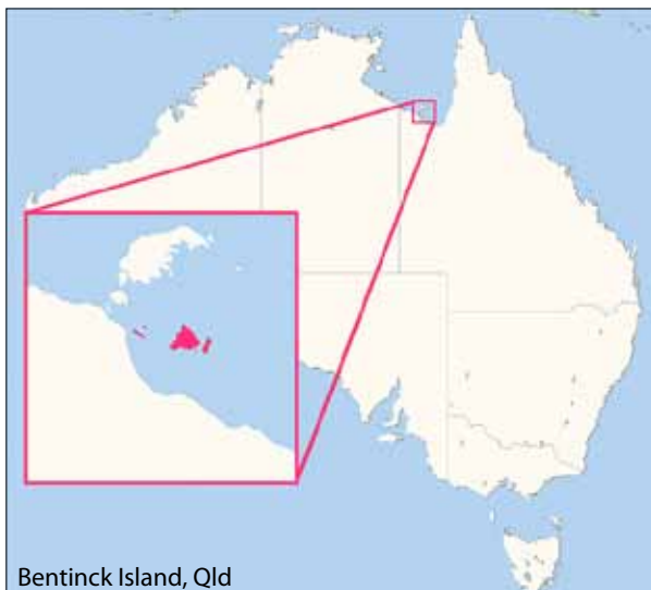
Bentinck Island, Qld

READ Young Achiever – Claudia Moodoonuthi on page 4