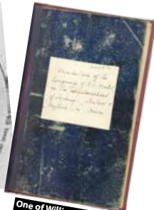
One of William Dawes' many diaries