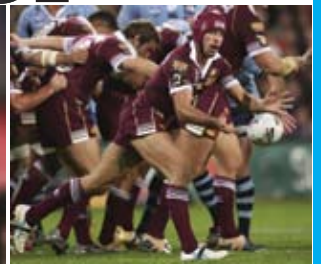
Johnathan Thurston in action (above); and (below) waving to the crowd after the Maroons' win.