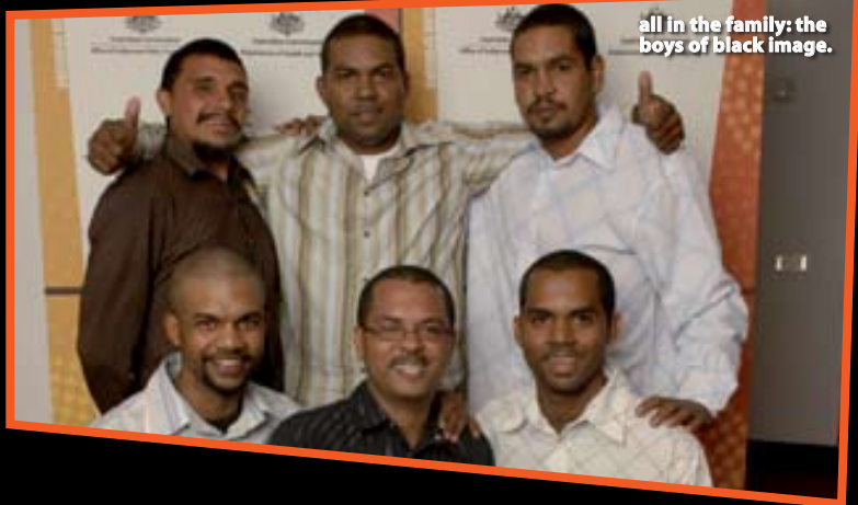
all in the family: the boys of black image.

B lack Image band released their first album in 2002 and, after years of touring around the countryside, they're back in the spotlight after winning this year's Deadly Award for Band of the Year.