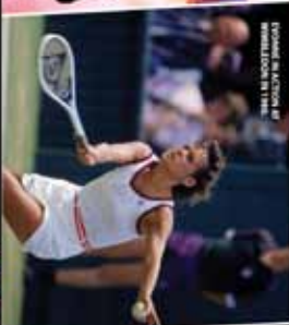
19 | Deadly 17th Awards 2011