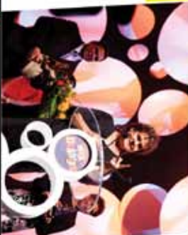
18 | Deadly 17th Awards 2011