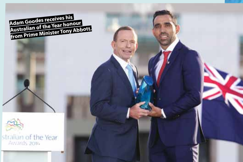
Adam Goodes receives his Australian of the Year honour from Prime Minister Tony Abbott.

In a country as special as Australia, Adam says that racism holds no place in our society although it is rampant – this is why as a nation that is connected in many ways we must make racism history and be proud of our heritage.