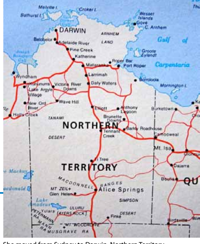
She moved from Sydney to Darwin, Northern Territory